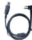
Programming Cable (USB Port) PC63