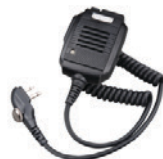
Remote Speaker Microphone (IP55) SM13M1